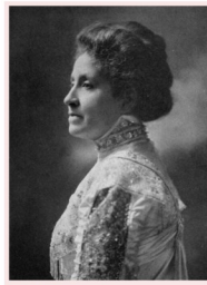
Francis Ellen Watkins Harper